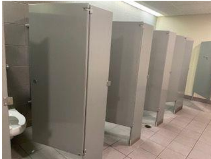
The women’s restroom. ID: Five bathroom stalls separated by gray dividers. The farthest from the camera is larger and has a door that opens outwards to facilitate wheelchair access.

for use by anyone who feels comfortable.” Restroom doors do not have an electronic opening mechanism; volunteers or staff will be available to help open doors. The bathrooms each have one wheelchair accessible stall.