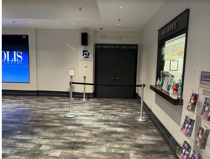
Metropolis lobby, right side. ID: The right side of a lobby with a gray floor and white ceiling and walls. Straight ahead is a gray door with a sign reading “Metropolis Theater.” Along the right wall is a service window with a sign reading “Box Office.”