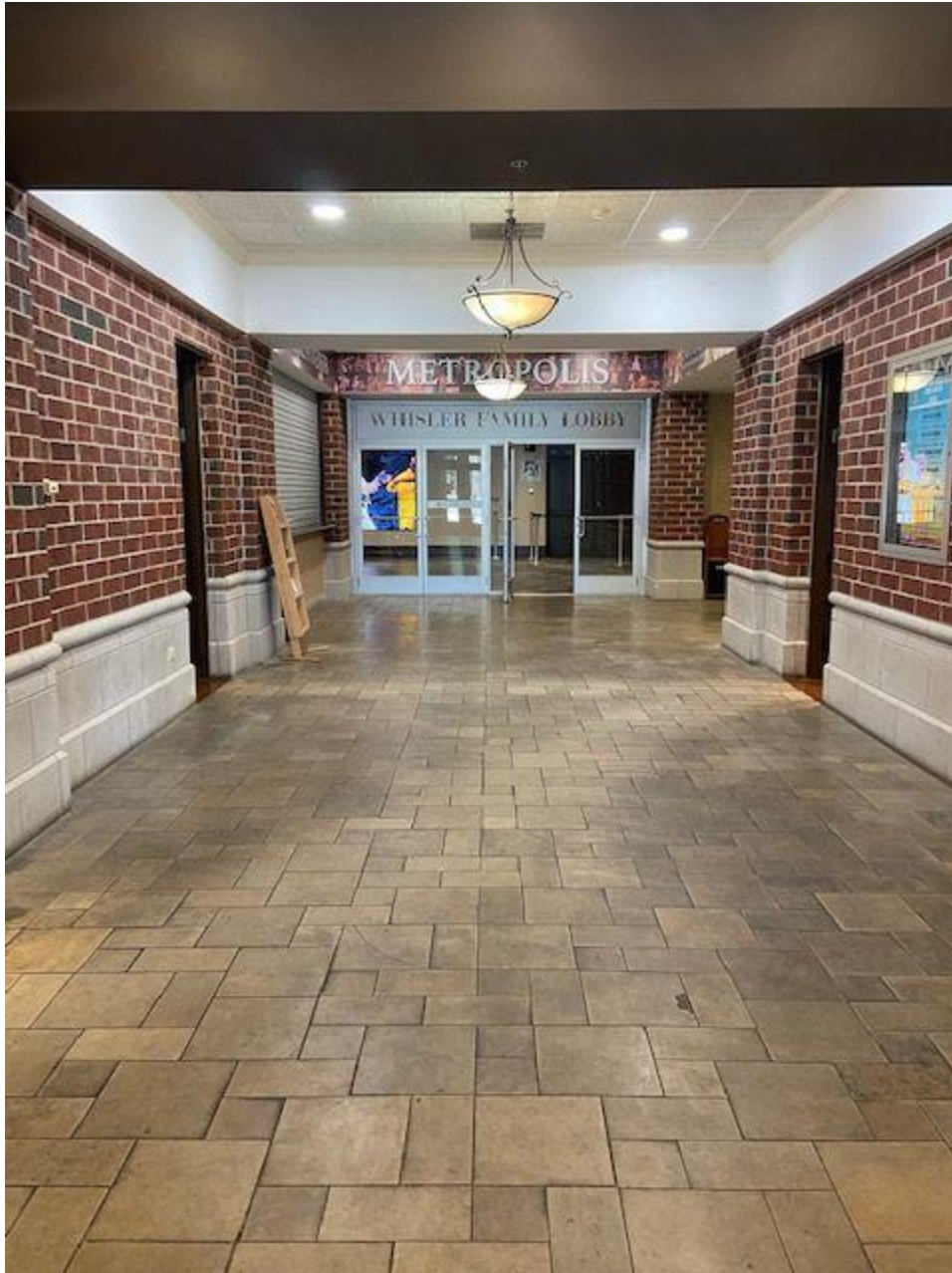
Metropolis lobby entrance. ID: A set of two double doors, made of clear glass and metal, at the end of a brick hallway. Above the doors is a sign reading “Metropolis Whisler Family Lobby.”

Metropolis Performing Arts Centre 111 W. Campbell Street, Arlington Heights, Illinois 60005 847-577-2121 MetropolisArts.com