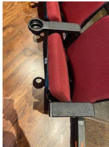
Image 1, right: An aisle at Metropolis Theater. ID: A row of widely spaced, carpeted brown stairs going down. There are red folding theater seats visible on either side, with one row per step.

Image 2, left: A seat in the front row. ID: A folding theater seat with red upholstery and black armrests. The left armrest has a cup holder. The floor below is wood-patterned laminate.