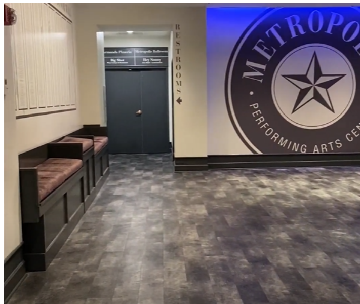
Bathrooms area. ID: A photo of the left side of the Metropolis lobby. To the left of a wall featuring the Metropolis logo is a sign reading “restrooms” that points to a recessed area.

Bathrooms are located on the left side of the lobby, indicated by a sign reading “Restrooms.” The restrooms are gendered, but have signage indicating they are “open